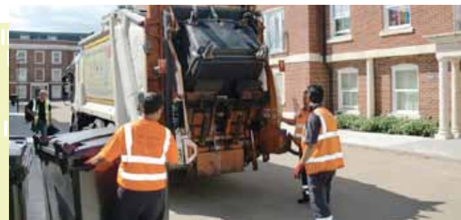
Urbaser working hard in the borough

Wheelie bins/waste sacks will be collected from the edge of your property. If you are unsure where to leave your rubbish, please contact Streetscene on 08000 198 598 .