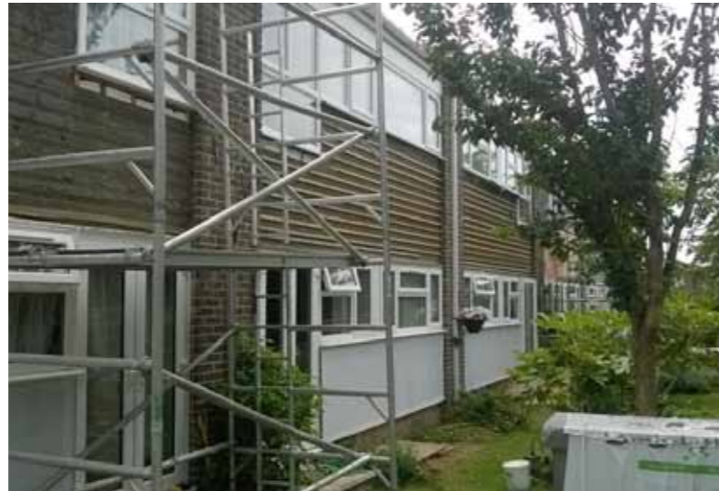
One end of Glebe Drive with wall insulation in progress