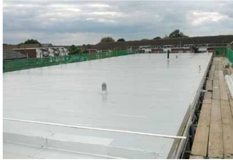
Roof at Archer House gearing up for a top coat despite those heavy clouds!