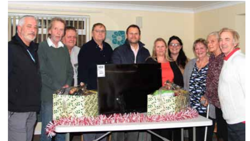
Members of the Nationwide Services team with some of the residents from Behrendt House.

This kind gesture has already improved the social interaction at the scheme with more residents using the communal lounge.