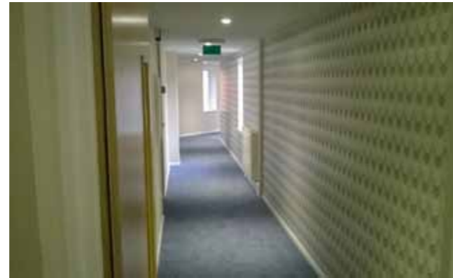
Completed halls with new carpet, wallpaper and oak style doors