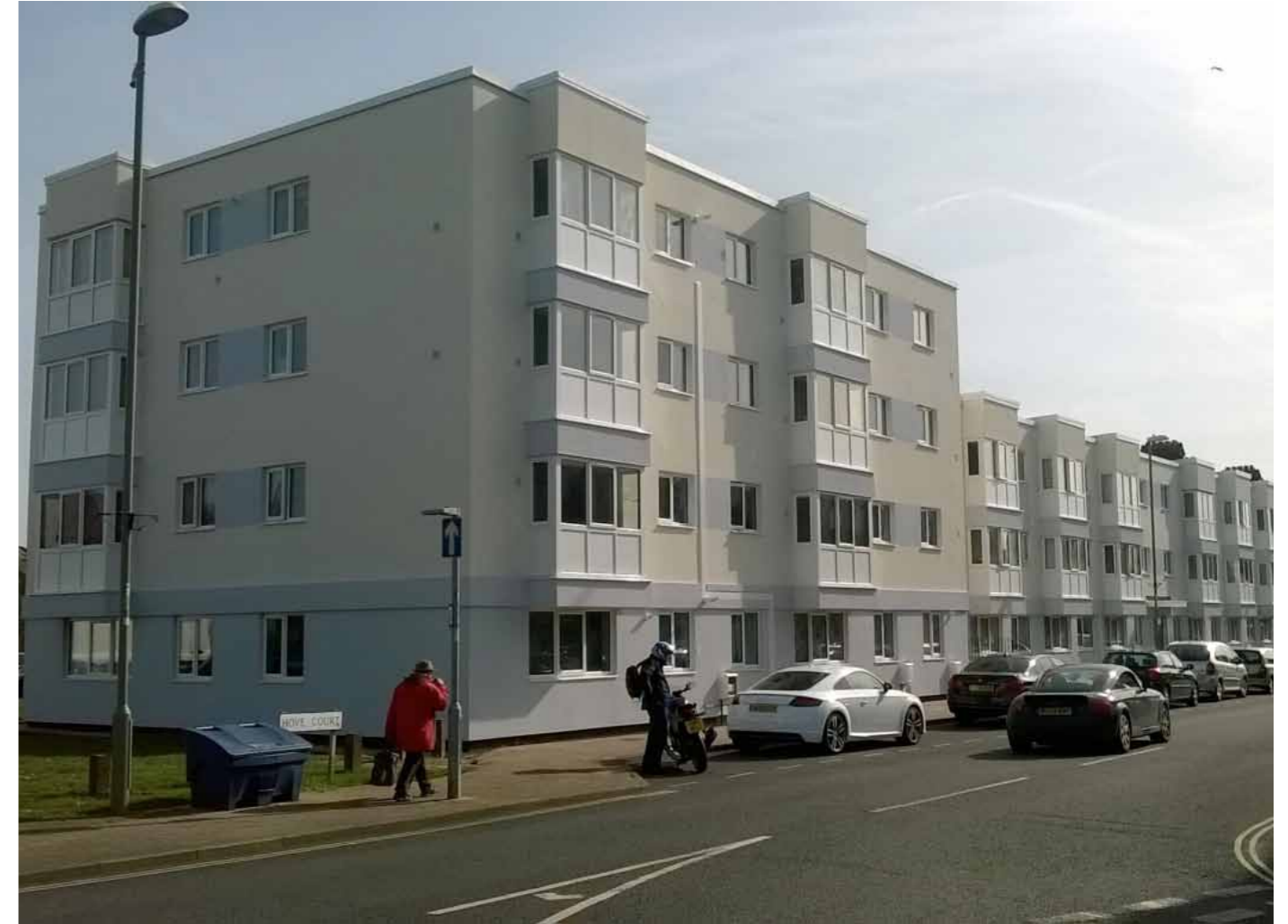
Hove Court looking splendid