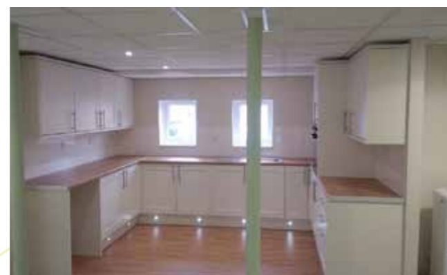
Completed kitchen at Gloucester House