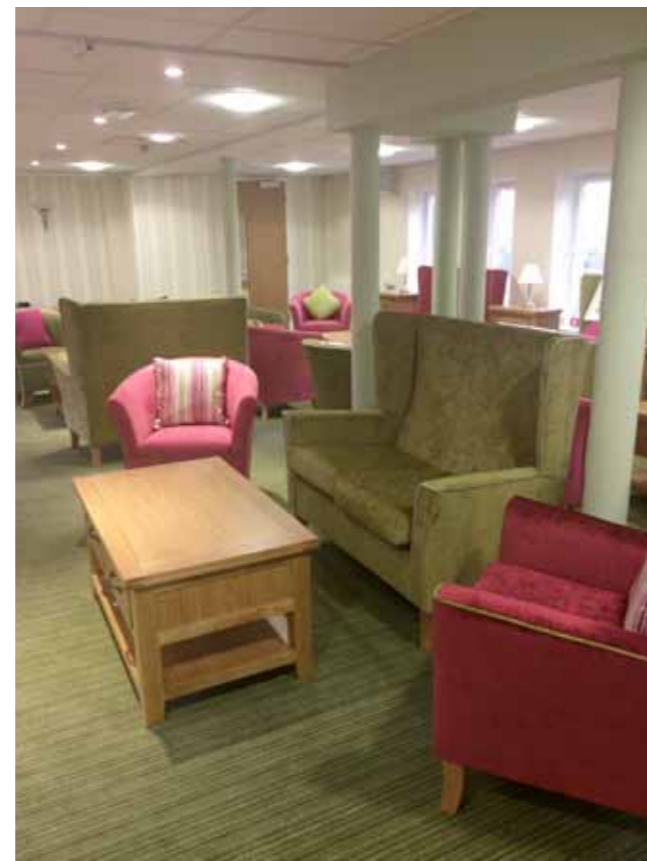
Gloucester communal area after