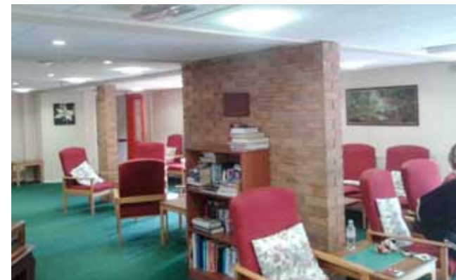
Gloucester communal area before

Mobility scooter storage has also been improved, allowing residents to store and charge their scooters securely. The scheme now also benefits from a guest room with en-suite facilities for visiting family members. The residents are delighted with the results of the refurbishment and enjoyed an event to celebrate the completion of the project.