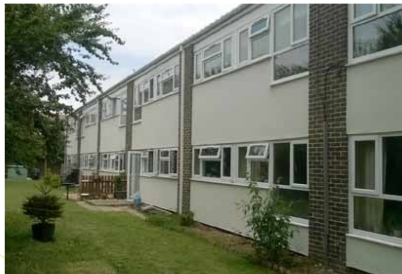
The other end of Glebe Drive already completed.