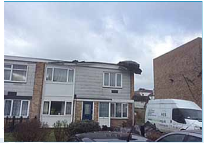
Damaged roof at Ash Close