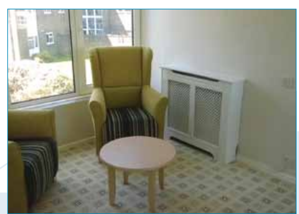
Seating area at Alec Rose House