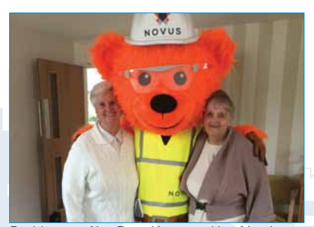
Residents at Alec Rose House making friends with the Novus Bear