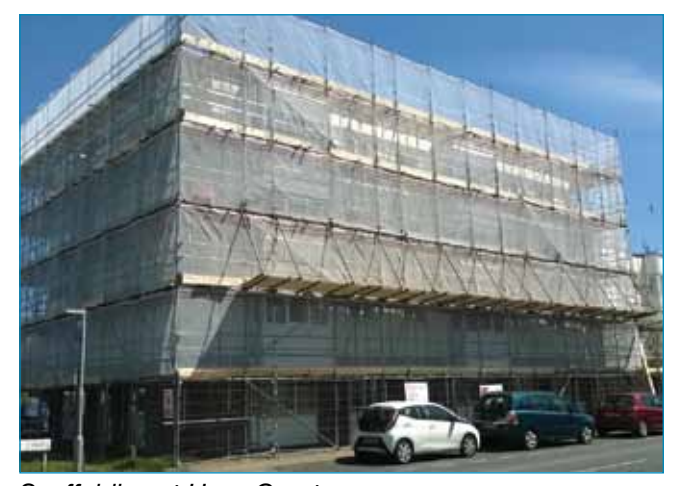
Scaffolding at Hove Court