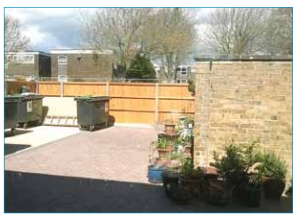
Garden area at Slocum House