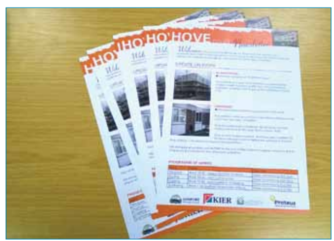
Hove Court newsletter