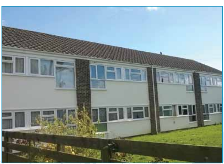
New wall insulation at The Links

Looking forward to the coming year insulation work will be carried out at Glebe Drive in Peel Common and Elmore Avenue along with Hove Court, Lee on the Solent which is now underway.