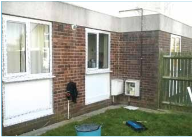
New windows at Hove Court

"I would like to praise you for acting so quickly with regards to the roof coming off at Ash Close. I couldn't believe that today the scaffolding was up, I am very impressed that it has all been dealt with so quickly."