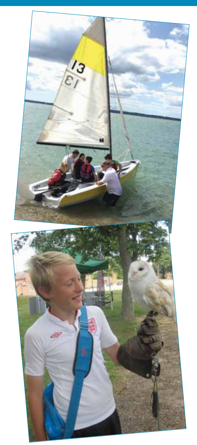
Young people enjoying the Summer Passport