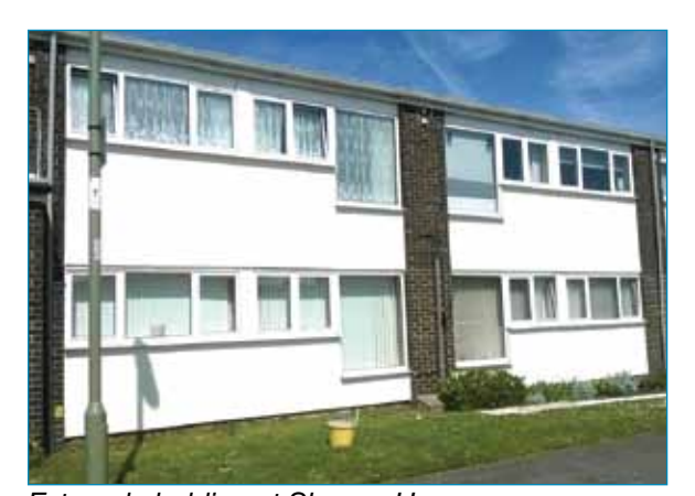
External cladding at Slocum House

New mobility scooter storage sheds have been installed at the back of Slocum House and it is hoped they will resolve any problems residents have with storing their vehicles.